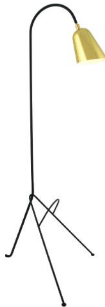
SEEN HERE WITH "B" SHADE